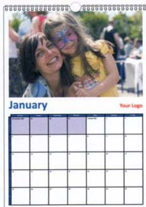
A3 Calendar 297mm x 420mm