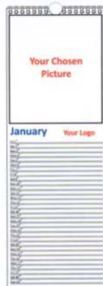
Narrow Calendar 148mm x 420mm