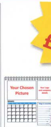
Desktop Calendar 210mm x 210mm