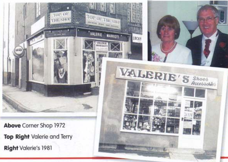
Above Corner Shop 1972